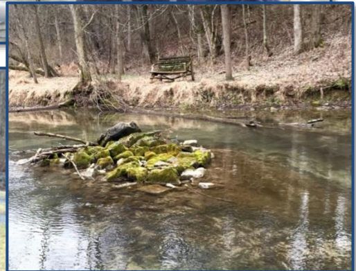
Big Spring PA Outing January 2016