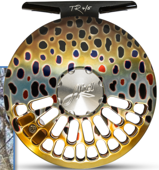
Abel Fly Reel (On my wish list)