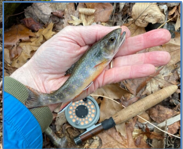
That is one huge Bamboo Rod!